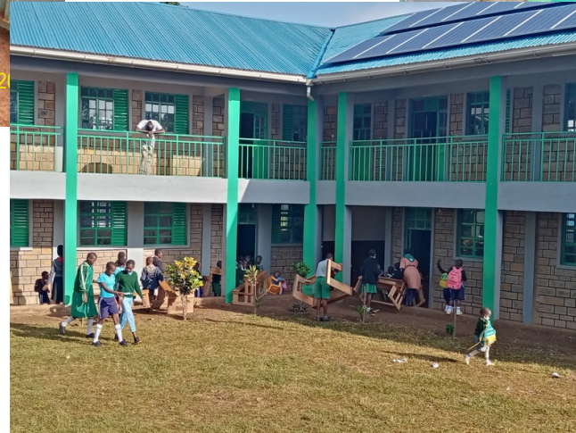
Lower: Primary school (completed in 2019), with new desks and solar array installed in 2021