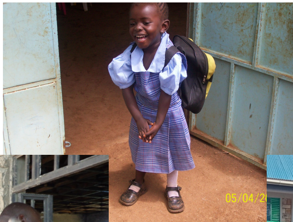
Lower: Primary school under construction in 2016